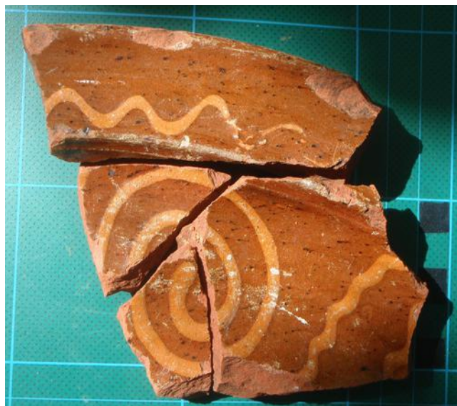
Fig 2: Metropolitan slipware dish, probably made in Harlow

Bartmann stoneware jugs (Fig. 4) also came from nineteenth century levels and complement a complete one (Fig. 4) on a bottle neck found in the park in 2011 by Adrian Hall, the park manager.