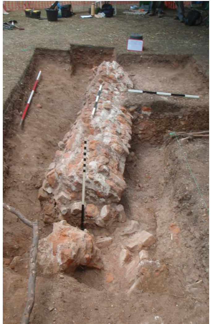
Fig 1: The demolished wall with the rubble filled ditch visible in section to the right

was granted the former palace estate by William III in 1688). The road, however, was probably still in use and being kept in repair until the later eighteenth century at least.