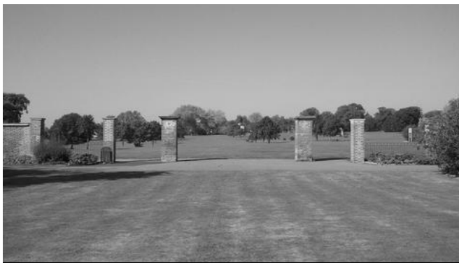
Fig 1: looking west towards the now gateless piers

The house was altered in the early eighteenth century when a staircase with a significant set of murals (dated 1726) by Gerald Lanscroun was installed, but probably at the same time the pre-existing Tudor garden around it was re-modelled as an (unusually partly surviving) 'Dutch' style Baroque water garden (first depicted on Rocque's mp of Middlesex of 1754). Extant or cartographically/archaeologically known elements of it include a line of three square and rectangular ponds on the west and two north south pond fed canals on the north, while west of the ponds a series of parterres are likely to have existed. West of them the west wall of the garden including entrance gaps/piers giving on to an originally Elm (now Lime) tree avenue are also likely to be of the early eighteenth century and in late 2011 the London Borough of Enfield, who were considering replacing the gates that would once have stood here, asked the EAS to monitor two small contractor cut evaluation trenches between the piers.