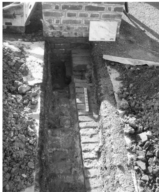
Fig. 3 Part of the larger central gap with the Tudor wall on the left, C18 th gate threshold higher on the right and again slightly projecting brick packing for the gate post next to the pier

Although a relatively small piece of work which (thankfully as it was a freezing cold day) took only a few hours, this adds to our understanding of just how the gardens at Broomfield were bounded or accessed at different periods and will hopefully inform the borough's plans for any restoration of what was probably quite an imposing gated entrance.