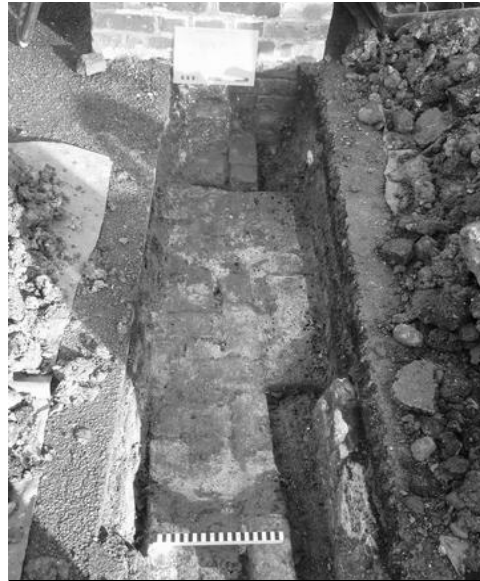
Fig 2: The buttressed Tudor wall running up to a brick reinforcing for the C18 th gatepost, next to the standing pier in one of the smaller gaps

century gate piers, the probable settings for separate gate posts and a brick threshold for the main gates.